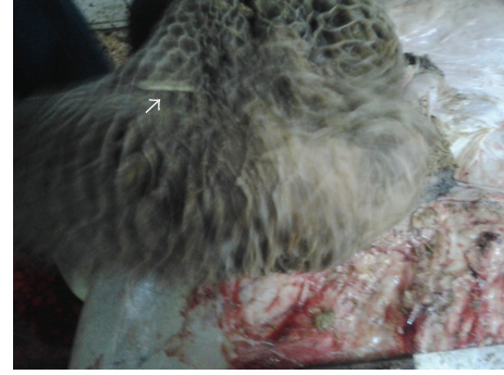
FIGURE 1: Buffalo with TRP showing foreign body perforating the reticulum.

APPs play a major role in the innate immune response involving physical and molecular responses that serve to both prevent inflammation and initiate the inflammatory processes, as well as clear potential pathogens, and contribute to healing [8]. To date, the changes in acute phase cytokines