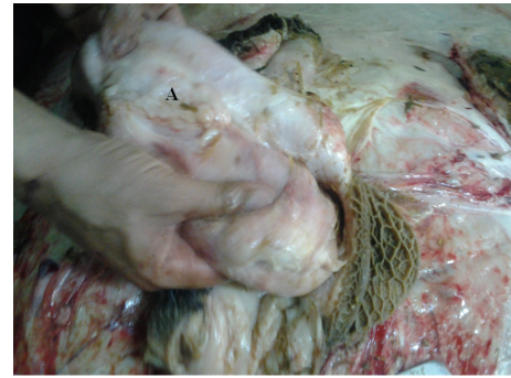
FIGURE 2: Buffalo with traumatic TRP showing peri-reticular abscess (A).